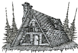
Hocking Hills Lodging Owners Association